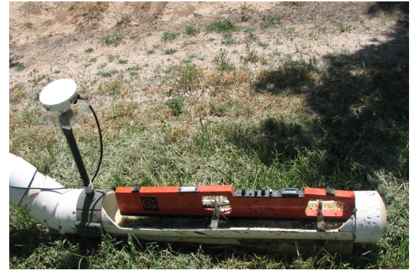
Electromagnetic induction meter fitted with GPS unit

Salinity is a major problem affecting farm profitability, water quality and availability in arid regions such as the Far West Texas. Understanding salinity distribution within an irrigated area is necessary for developing effective salinity management practices. Conventional methods of assessing soil salinity at a detailed spatial resolution are expensive and time consuming. Electromagnetic induction (EMI) technique can determine soil salinity distribution in irrigated areas rapidly and in a non-invasive way. Advantages of this method are (i) high mobility, (ii) non-invasive way of salinity assessment and (iii) short time required to carryout the salinity assessment. However, EMI technique's accuracy is influenced by site specific factors such as soil clay content. This project evaluates the accuracy and factors affecting the accuracy of EMI technique to delineate salt distribution in the affected fields. The results of this project can help farmers to reduce salinity management costs by target application of amendments to salinity hotspots within the affected field.