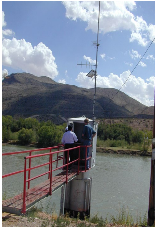
Telemetry Gauge Station

Support Provided by: El Paso Water Utilities, U.S. Army Corps of Engineers, U.S. Bureau of Reclamation, USDA-NIFA, Texas A&M AgriLife Research, Texas Water Resources Institute and, New Mexico State University and NM Water Resources Research Institute