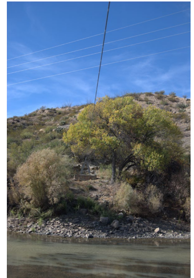
Gage Station below Elephant Butte Dam