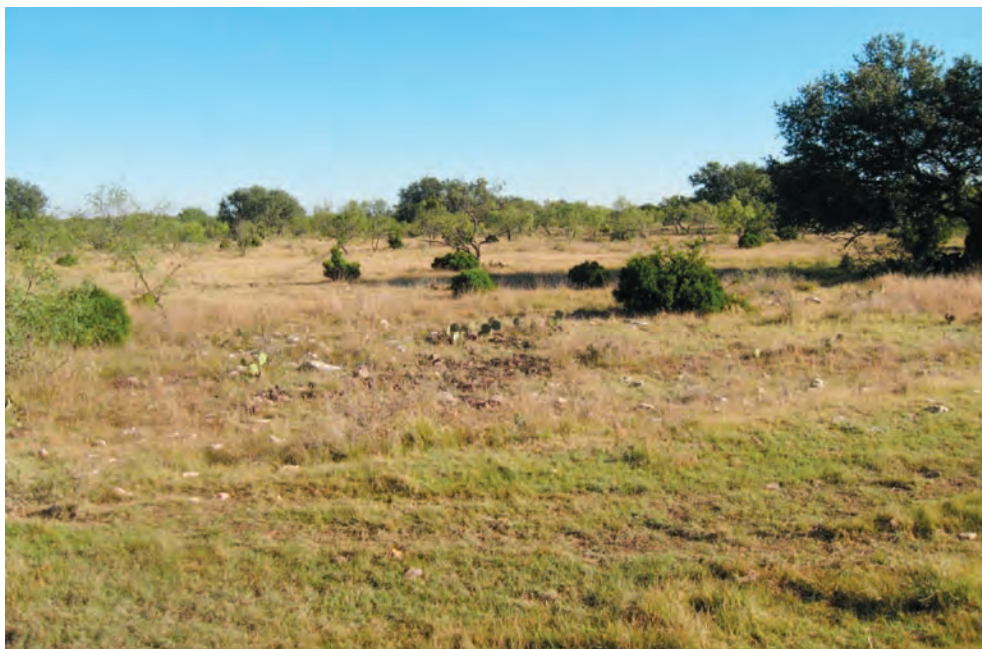
On this cattle and goat grazed pasture the hedged juniper bushes show how goats can keep juniper at a manageable level while still allowing forage for cattle.