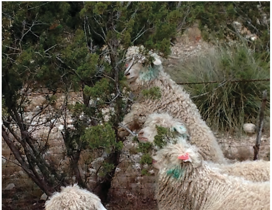
Goats readily consume juniper and at certain times of the year it may make up over 20 percent of their diet.

Over the years I have raised and trained both blue heelers and border collies. One of the smartest dogs that I ever had was a blue heeler named Gaucho. He would bark when signaled with a barely perceptible twitch of my finger. This ability allowed him to amaze people as he did arithmetic or answered questions with one or two barks for yes or no. He fell dead when shot with an