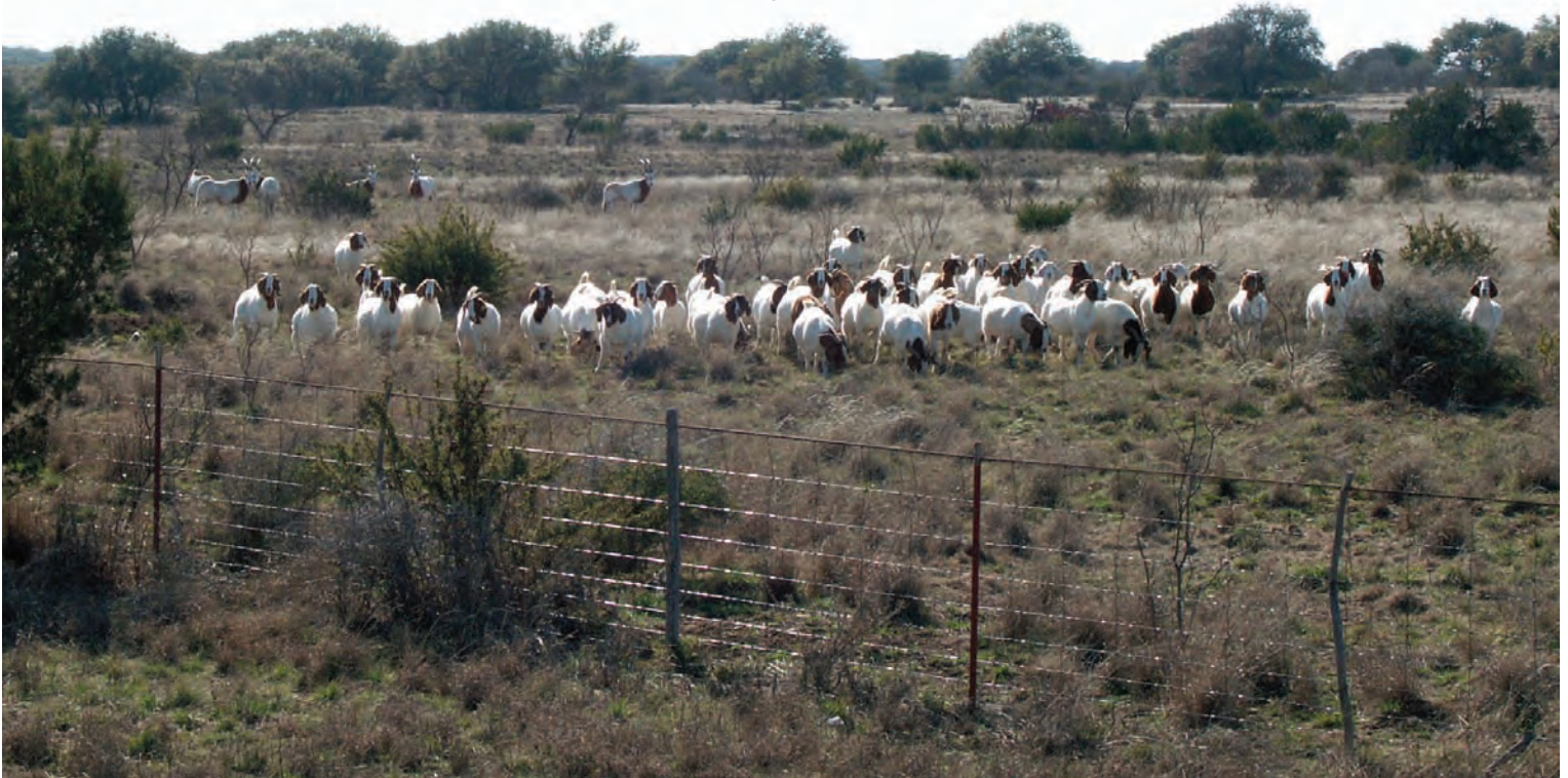
These healthy Boer goats in Sutton County, Texas, have obviously been whittling down the juniper in their pasture.