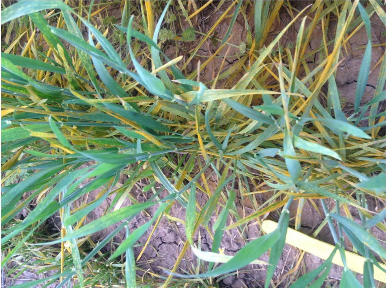
Figure 2. Heavy stripe rust infection in lower canopy – San Angelo, TX March 2015