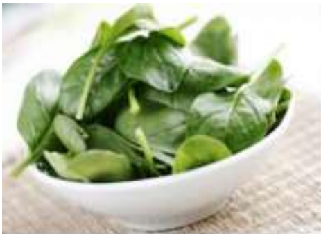
Wintergarden Spinach Producers Board